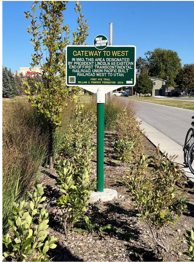
Great American Rail-Trail marker in Council Bluffs, IA.