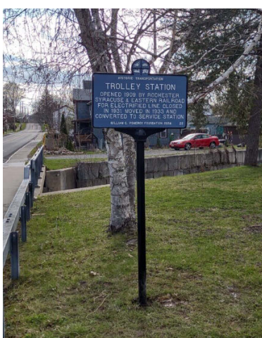
Trolley Station marker in Jordan, NY.