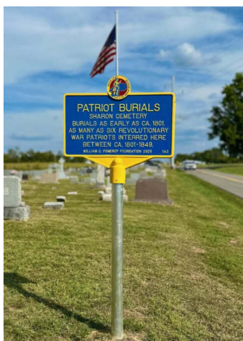
Patriot Burials marker in Augusta, KY.