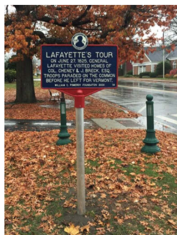
Lafayette's Tour marker in Newport, NH.